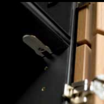
Structural shelving with zinc plated ratix fixings