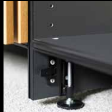
4 adjustable levelling load bearers