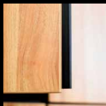
Dust proof soft seal door edges for soft closing