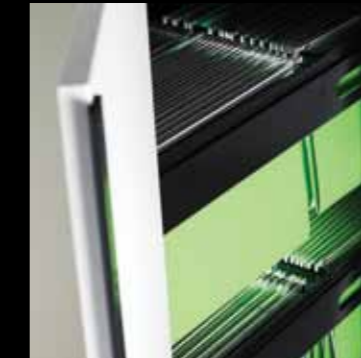
Roll out filing