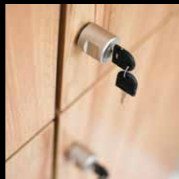
Lock & turn integral removable barrel lock