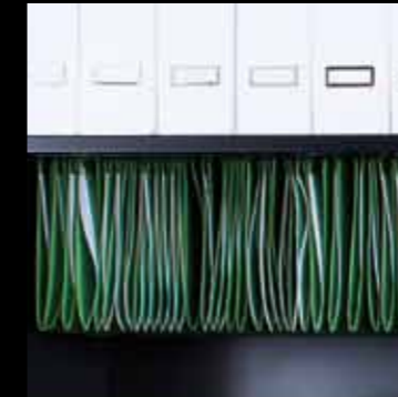
Combination shelf filing