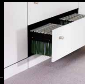
Drawer with suspension filing