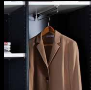
Pull out coat rail