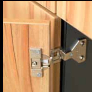
Built-in 'stay closed' 180° opening hinges